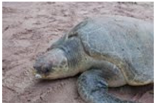
Fig. 1. Closure view of the green turtle at Pamban

The presence of one female green turtle (Fig. 1) along with its nest were reported on the sandy beach of Pamban landing centre along the GOM on 15-01-2011 (from 05.10-06.20 hrs) (Fig. 2). Shore and near shore water of the GOM were calm. Local enquiries revealed that it laid eggs at 04.30 hrs. The nest was filled with eggs. The position of the nesting pit was noted. All the eggs were removed and counted by excavating the nesting pit with the help of Forest Department staff who were already present on the spot (Fig. 3). The nest was excavated and the depth of the nest from surface to the bottom was measured (Fig. 4). To protect from natural predators, the eggs were safely transferred and buried in pits for incubation in a beach hatchery by the Department of Forests, TamilNadu. To determine the egg size, twelve eggs randomly collected at the time of translocation were