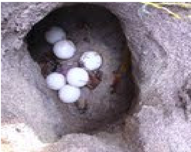
Fig. 4. Nesting pit of the green turtle observed at Pamban

measured using a vernier caliper and each egg was then weighed with an electronic balance to the nearest 0.1 g. Morphometric measurements were also taken using a flexible tape. The distance from the shore during high tide to the nesting pit was also measured.