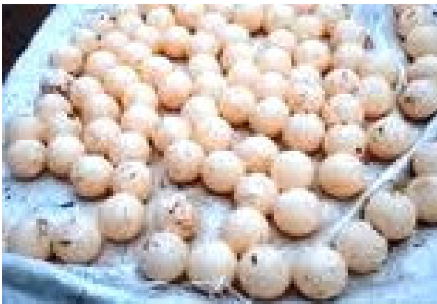
Fig. 3. Eggs of the green turtle kept on the plastic mat